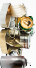
Empty Metal and Aerosol Cans (aluminum, tin, and foil)