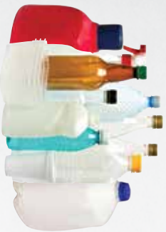
Plastic Containers (#1 - #7)