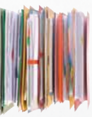
File Folders and Office Paper (all colors)