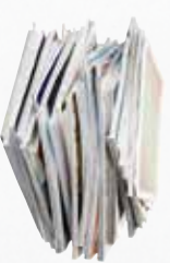
Magazines and Phone Books (catalogs and soft cover books)