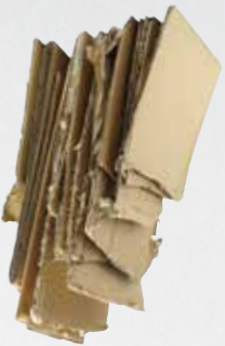
Corrugated Cardboard (wavy center layer)