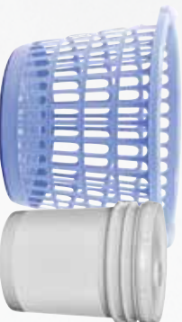
Large Rigid Plastics (5-gallon pails and laundry baskets)