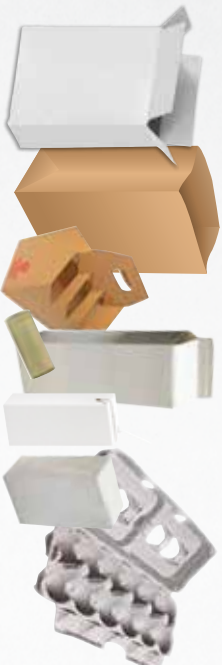
Boxboard and Paper Cartons (dry-food boxes, cores, paper bags, and egg, milk, and juice cartons)