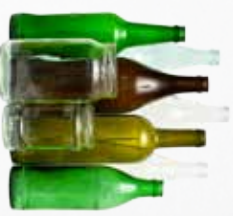
Glass Bottles (food jars and beverage)