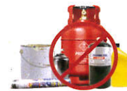
HAZARDOUS MATERIALS OR EXPLOSIVES