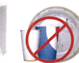
WAXY COATED PAPER ITEMS