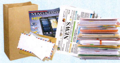
Junk Mail, Periodicals, & Office Paper (Paper bags, envelopes, & catalogs)