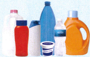
Plastic Bottles, Jugs, Tubs, & Lids (Empty kitchen, laundry, & bath containers)