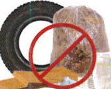
WOOD, WASTE, OR TIRES