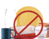
CERAMICS OR BAKING GLASS