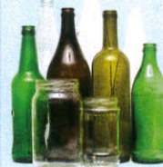
Glass Bottles & Jars (Empty food & beverage bottles & jars)