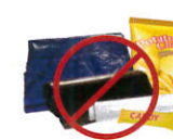
PLASTIC WRAP, FILMS, OR TARPS