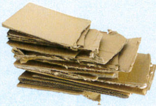
Corrugated Cardboard (Wavy center layer)